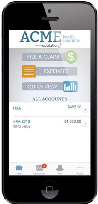
Above: With the convenience of a mobile device, you can see your available balance anywhere, anytime as well as file claims and upload receipts.

*The amount you save in taxes with a Flexible Spending Account will vary depending on the amount you set aside in the account; your annual earnings; whether or not you pay Social Security taxes; the number of exemptions and deductions you claim on your tax return; your tax bracket and your state and local tax regulations. Check with your tax advisor for information on how participation will affect your tax savings.